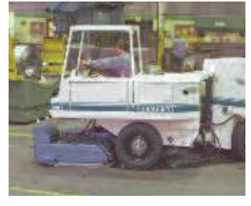
Articulated power steering makes it easy to maneuver, even around sharp corners.