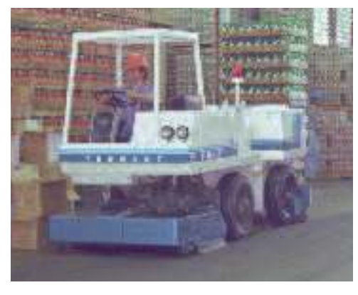
Driver's view is unobstructed and controls are easy to reach.