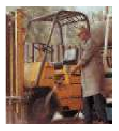
The high pressure spray option goes to work wherever you need it — blasting away grease, oil and dirt.

The SRS (Solution Recycling System) prolongs operating time and uses up to 49% less cleaning solution.