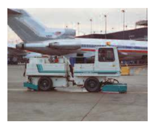
The 1550 efficiently picks up de-icing fluid from runways and covers 12 times the area of standard scrubbers without the need to empty and refill the solution tanks.