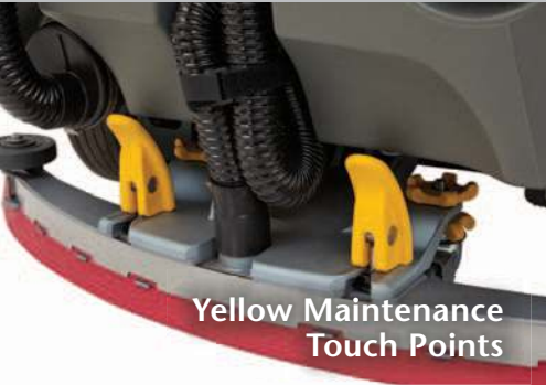
Yellow Maintenance Touch Points